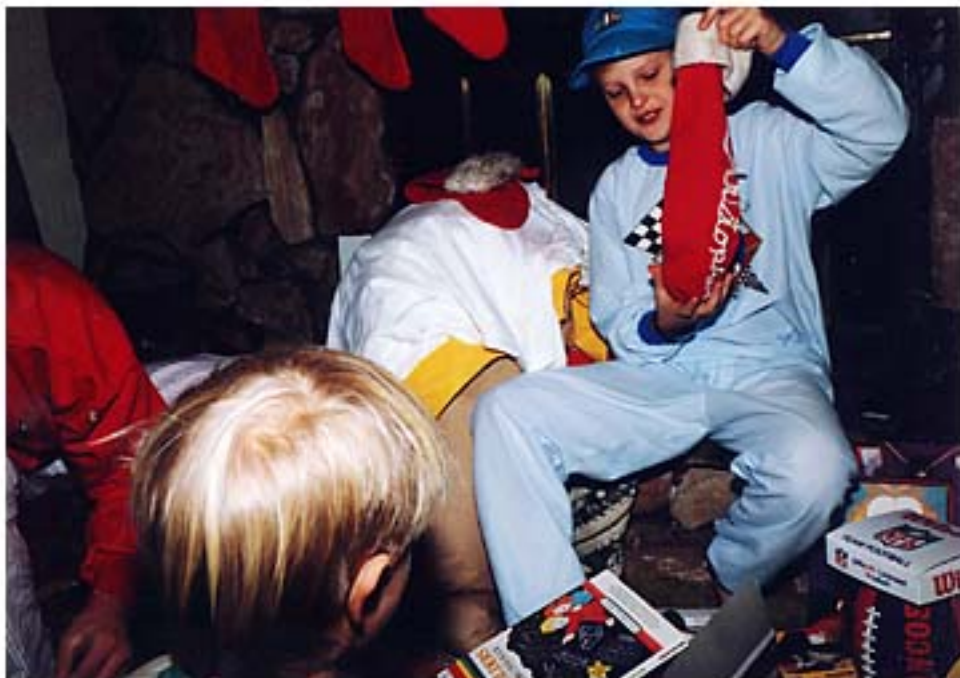
Christmas with the family