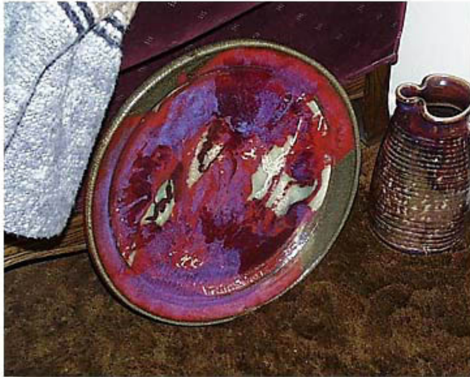
Probably my favorite ceramic piece that I've ever made, It's about 3 1/2 feet wide, big enough to cook a kid! =)