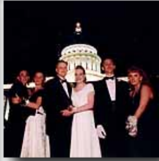
Prom at the Capital