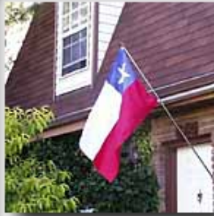
My Chilean Flag