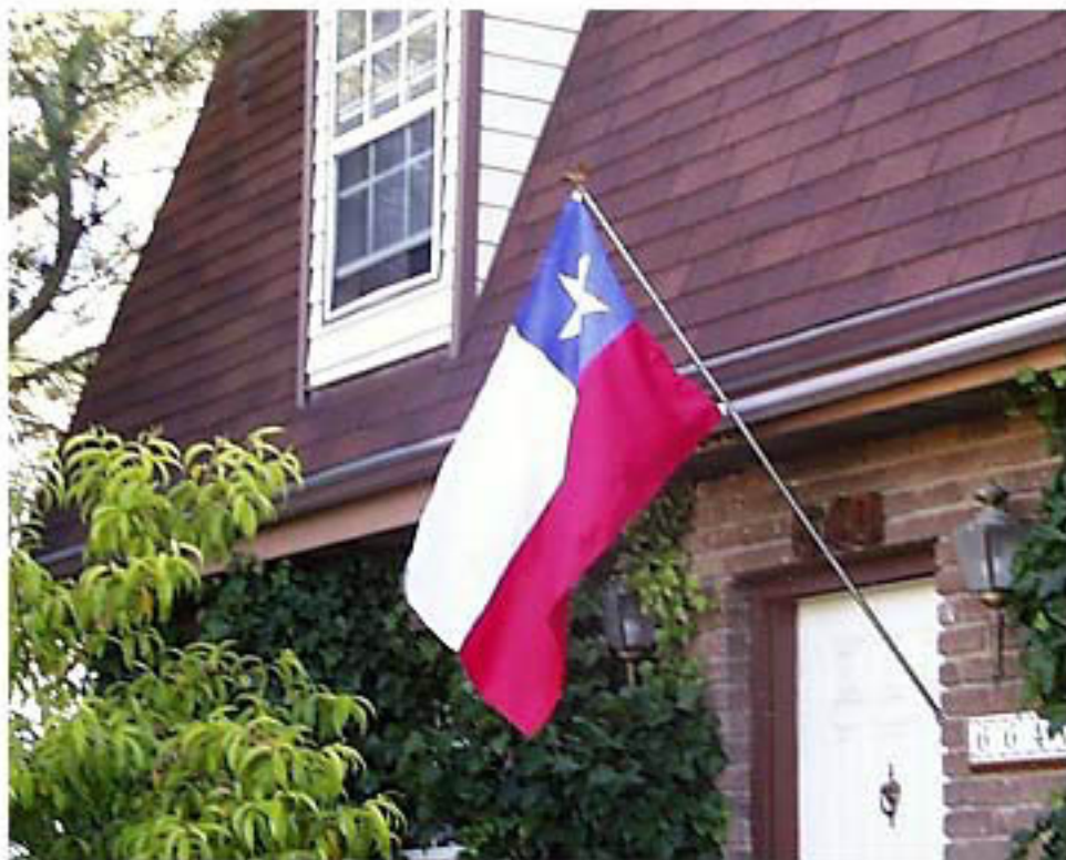
Chilean Flag flying during my Homecoming