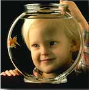
My Fish and I