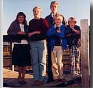
On the Bridge