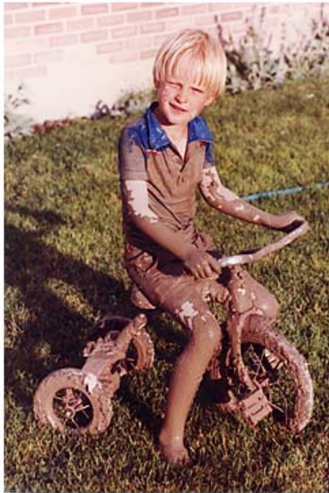
Me on my muddy trike, I rode it through our neighbor's mud hole.