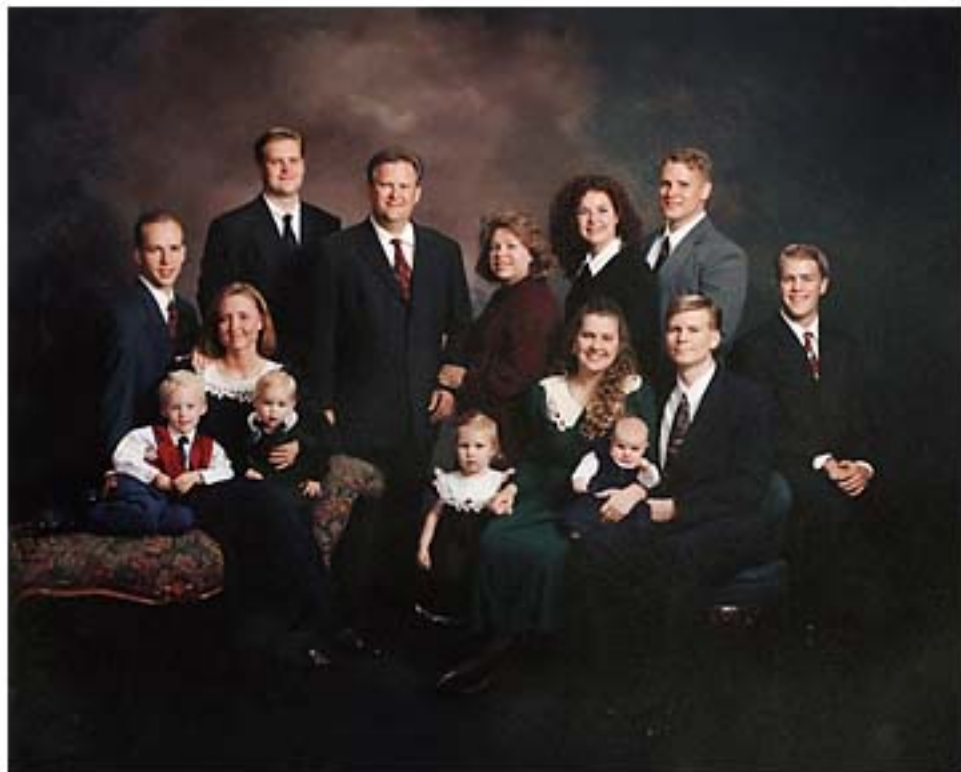
Our family portrait, August or so, 1998. This is the first portrait we have (that I know of) that has my Dad in it, he's usually taking them!