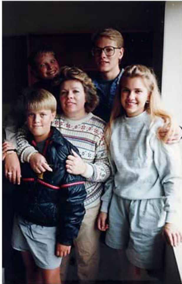
All together (except my Dad, he's taking the picture) We were in Oregon