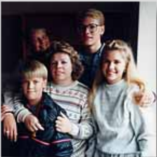
The Fam. In Oregon