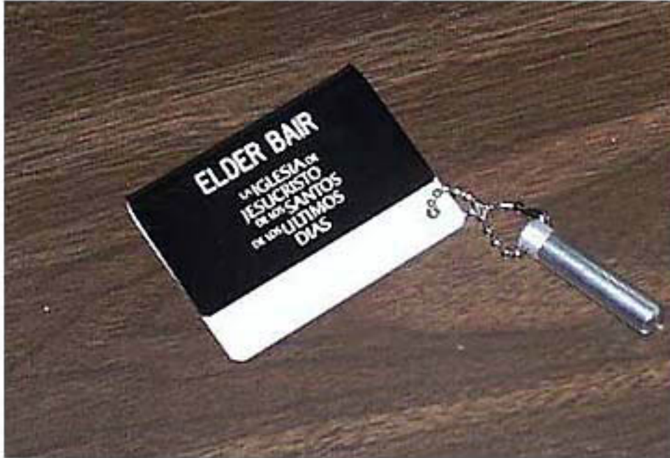
My name tag converted into a Keychain